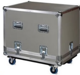
MIL SPEC Transport Case