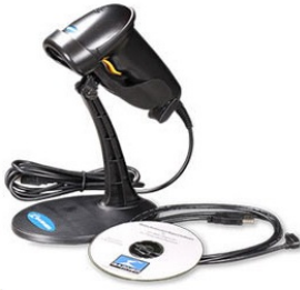
SCAN-1 Media Destruction Report Generator